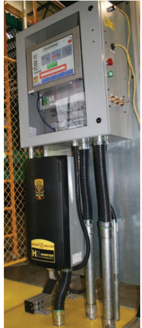
Flexco engineers say that using a variable frequency drive is critical to not only jog the conveyor forward and backward, as well as control the speed very precisely.

When Flexco engineers began this project, they, with the full support of the company’s board of directors, were determined not to sacrifice quality or settle for second best. Today, they say they are proud to have Baldor equipment on their rig, and Flexco