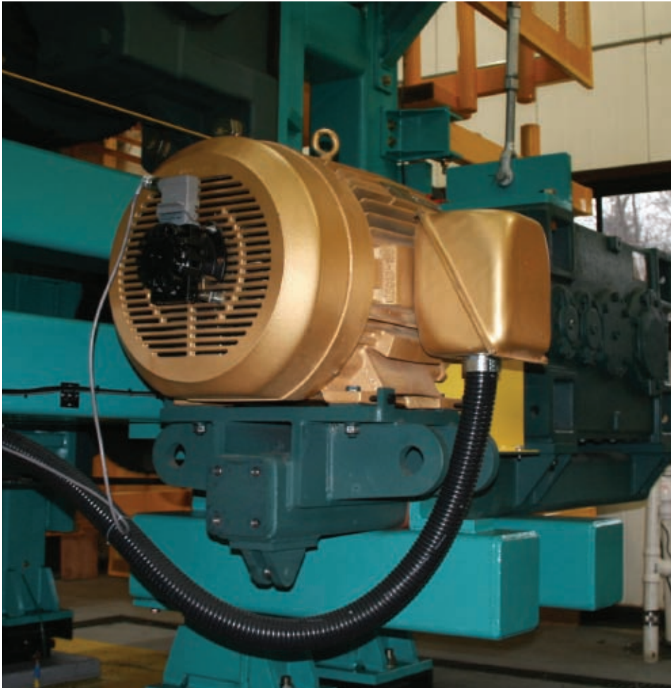
Data acquisition, including tracking motor speed, is critical to Flexco engineers, who specified an encoder be added to the Baldor•Reliance Super-E motor.

rig, and belt width will vary from 10 to 36 inches, making it a very demanding application.